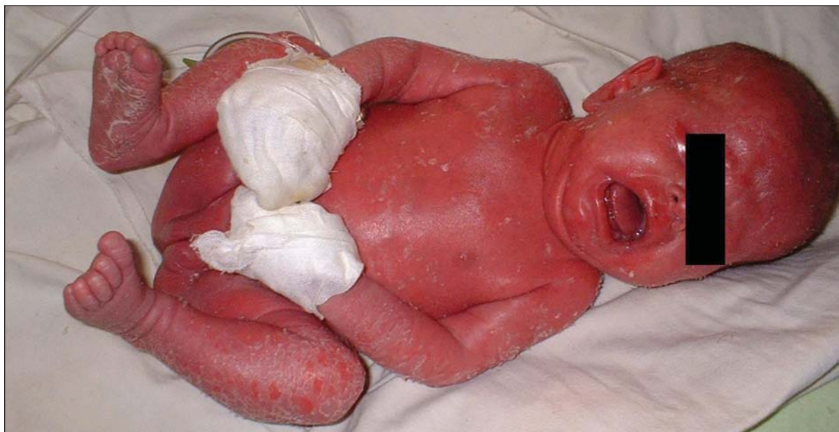
Figure 1. Erythematous scaly lesions on all over the body and scalp, her scalp hair was dry scarce and brittle especially short in the temporal and occipital regions.