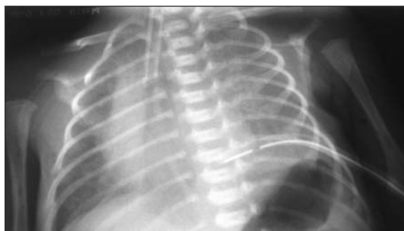
Figure 1. Chest X-ray showed a large amount of fluid in the left pleural space and a slight mediastinal shift and a chest tube was placed to drain the hydrothorax.

A male infant born vaginally, 28 weeks gestational age, 1250 g body weight, was admitted to the NICU. Apgar scores were 7 and 9 at 1 st and 5 th minutes, respectively. During the first days of life he required continuous positive nasal airway pressure and parenteral nutrition via an umbilical central venous catheter. He received ibuprofen for closure of patent ductus arteriosus. On day 16 th , he had necrotizing enterocolitis and a central venous catheter was placed into the left subclavian vein for fluid replacement and parenteral nutrition. A chest X-ray film to check the position of the catheter demonstrated normally positioned hemidiaphragms. On 18 th day, the patient suddenly presented with respiratory compromise, with tachypnoea, tachycardia and sudden increase in her oxygen requirements requiring mechanical ventilation. Heart sounds and breath sounds on the left hemithorax were difficult to hear. The chest X-ray showed a large amount of fluid in the left pleural space and a slight mediastinal shift. A chest tube was placed to drain the hydrothorax (Figure 1). The