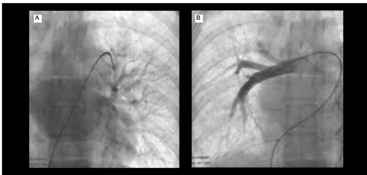
Figure 2. A: Selected left pulmonary artery angiography: normal perfusion of the left lung with normal pulmonary veins draining into left atrium, B: Selected right pulmonary angiography: decreased perfusion of the right lung with no pulmonary veins on this side.

It may have a grave prognosis. If left untreated mortality rate is reported to be as high as 50% (3).